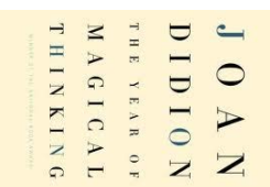
The Year of Magical Thinking Joan Didion