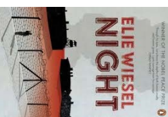
Night Elie Wiesel